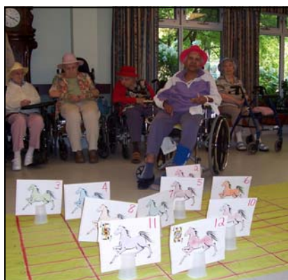
Five residents enjoying the races