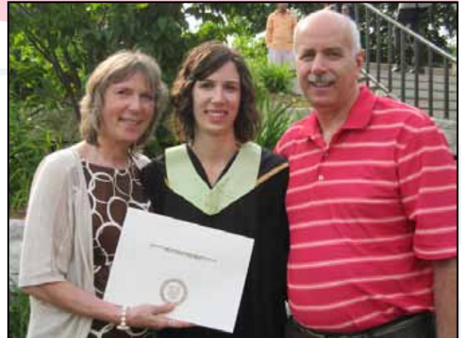
June from the University of Waterloo. She also received the David J. Kerko Low Vision